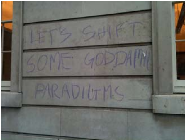
UCL Student Protests, London, 2010