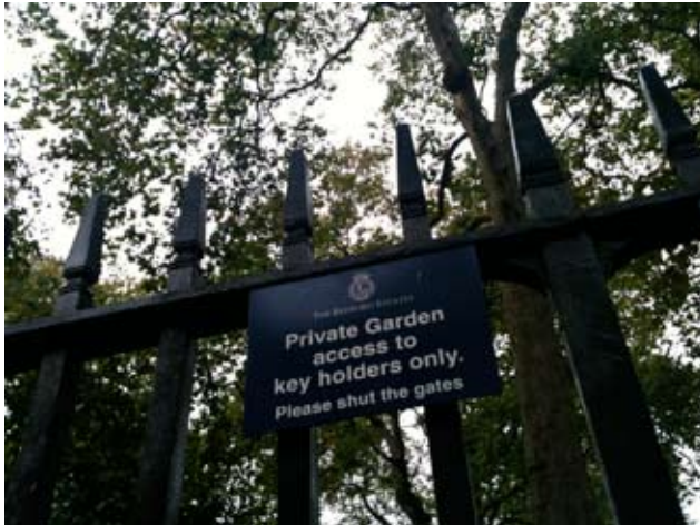
Bedford Square, London, 2010