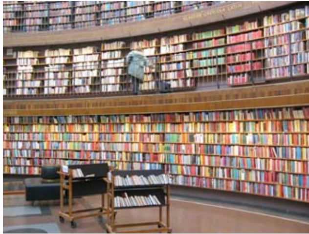
Public Library, Stockholm, 2006