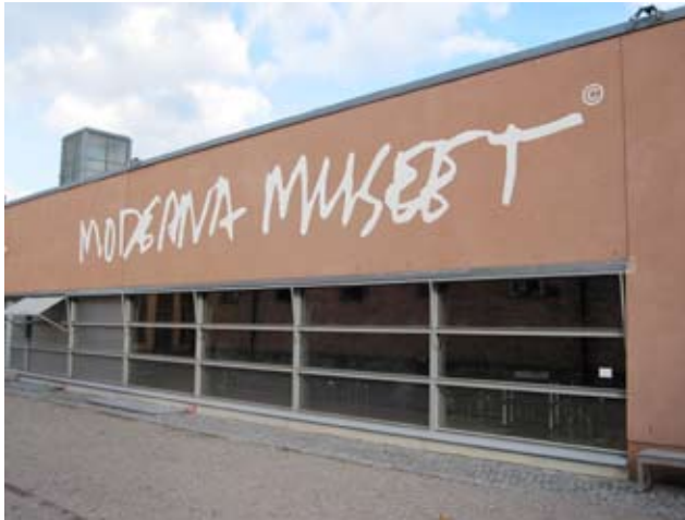
Marysia Lewandowska, How Public Is The Public Museum , Moderna Museet, 2010