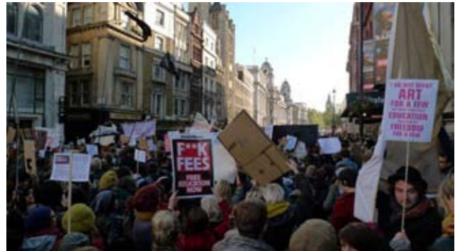
National Union of Students March, London, 2010

LP: I'm rather interested in something Stadler suggests here, that today our very notion of public space is both comprised of an immaterial digital commons as well as our more traditional physical spaces for gathering or exchange. Can we think of online space as a public space in and of itself? And if so how might we characterize it? It seems to me a rather ad hoc kind of public space, and its non-physical, deterritorialized nature certainly makes it harder to ensure that protections here can be equally offered to everyone. On the one hand it seems to be a site with unique democratic potentialities—think of Iran's »twitter revolution« or Wikileaks »cablegate«. But it also smacks of a privatized, corporate sort of public space as well—like Facebook or Google. A parallel to the later might be to imagine urban corporate atriums or the food courts inside suburban malls. While we are all allowed to enter and occupy these spaces for »free« our behavior inside of them is always instructed by and ultimately subject to the rules and logic of the corporation. Maybe we need to start recognizing that the information architecture and code used in constructing a website is equally like architecture in physical space—on some level it embodies ideologies and controls our behavior.