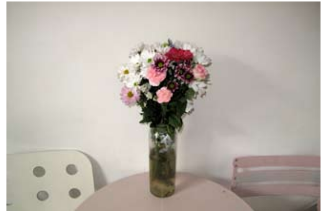
David Horvitz, artwork freed into the public domain, 2010

lates a possibility of active engagement in the thinking and deciding that the visitor and owner of the distributed gift is empowered through. A similar reminder appears on the façade of the museum building where the logo is clearly painted. By adding the copyright sign I wanted to bring to the public attention the fact that despite the original writing having been offered in a generous gesture by Rauschenberg, to ensure its exclusive rights it had to be withdrawn from free circulation and locked into an exercise of branding.