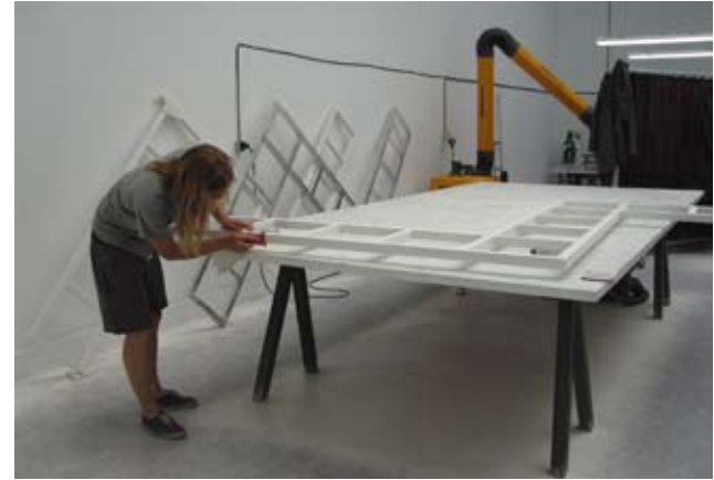
Manufacture of Sol LeWitt's copy, Van Abbemuseum, Eindhoven, 2010

It's always been interesting to me that while intellectual property issues have been well discussed inside certain discourses, like the legal one or the new media one, the art world still seems strangely oblivious or indifferent to these questions. There is work to be done there.