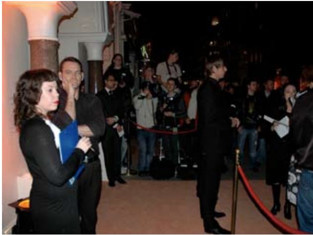
Sotheby's, London, 2007