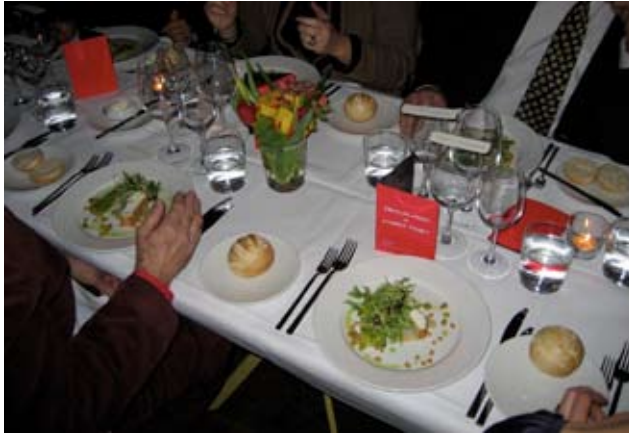
By Invitation Only, Moderna Museet, Stockholm, 2007